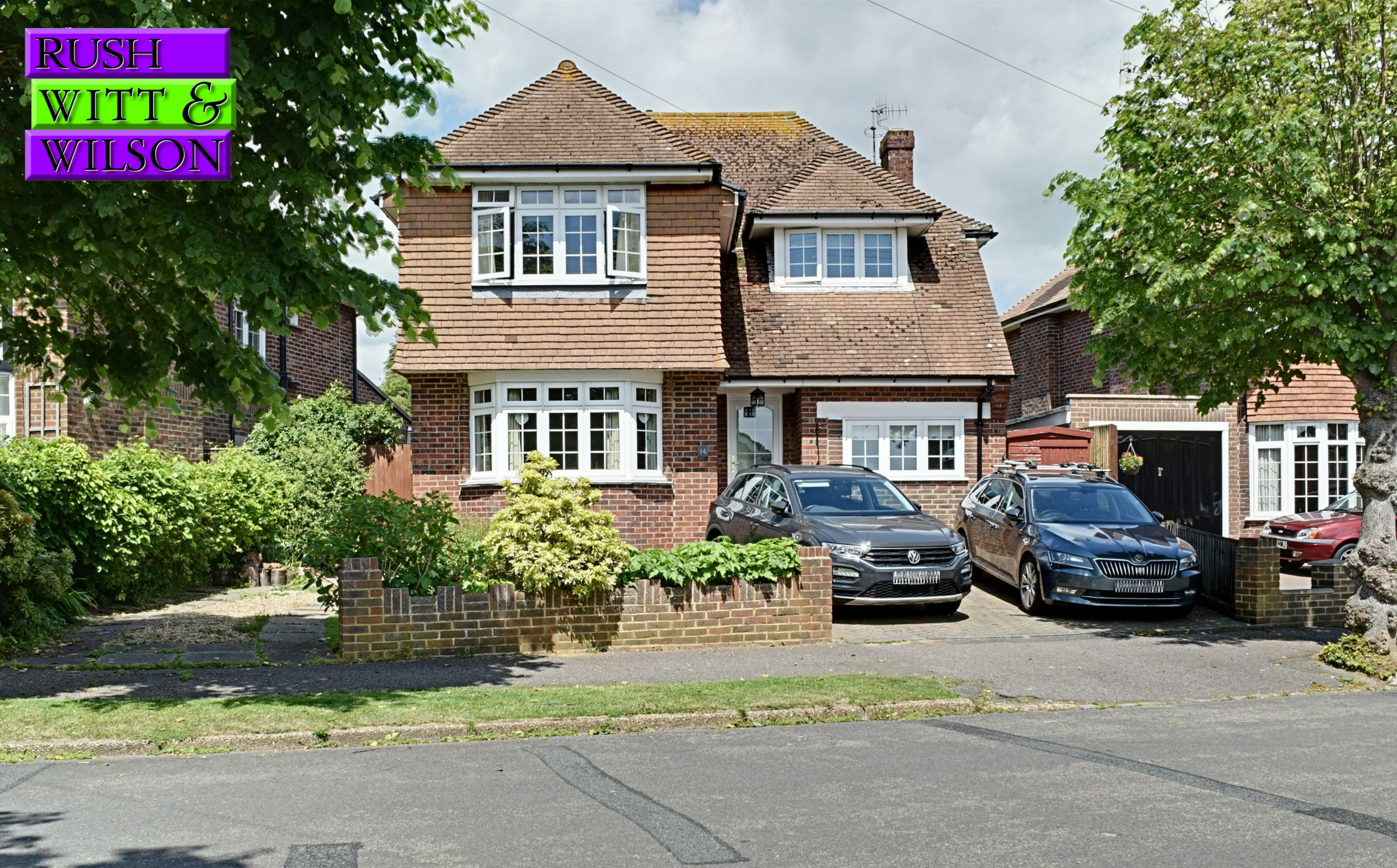
14 Glenleigh Avenue, Bexhill-On-Sea, East Sussex TN39 4EG Offers In Excess Of £520,000